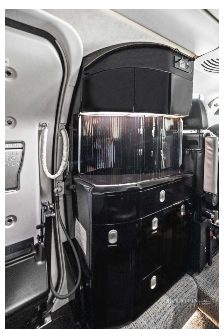
Specifications subject to verification upon inspection. Aircraft subject to prior sale without notice.